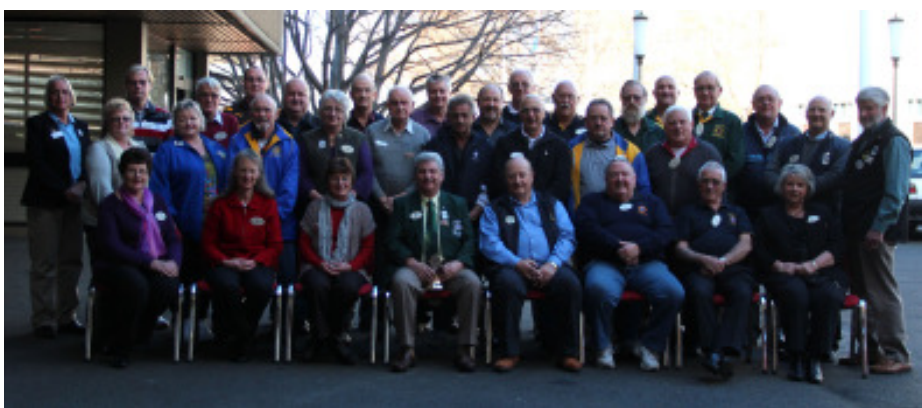
... the 2012/13 District Cabinet was photographed during a break at the first Cabinet meeting for the year held in Hobart in July